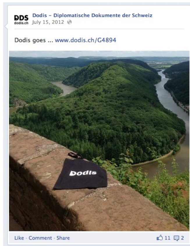
Post on the Dodis Facebook page with a link that takes the visitor to the extensive database of documents.

This social media campaign cleverly promotes the database and triggers quite some engagement among the community around the Dodis Facebook page. Some of the pictures are taken by Dodis staff, others are sent to them by the community. When submitted by outsiders, the team looks for the corresponding document and links it in the post.